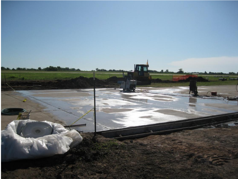
Saw-cutting new concrete panels on Taxiway Bravo