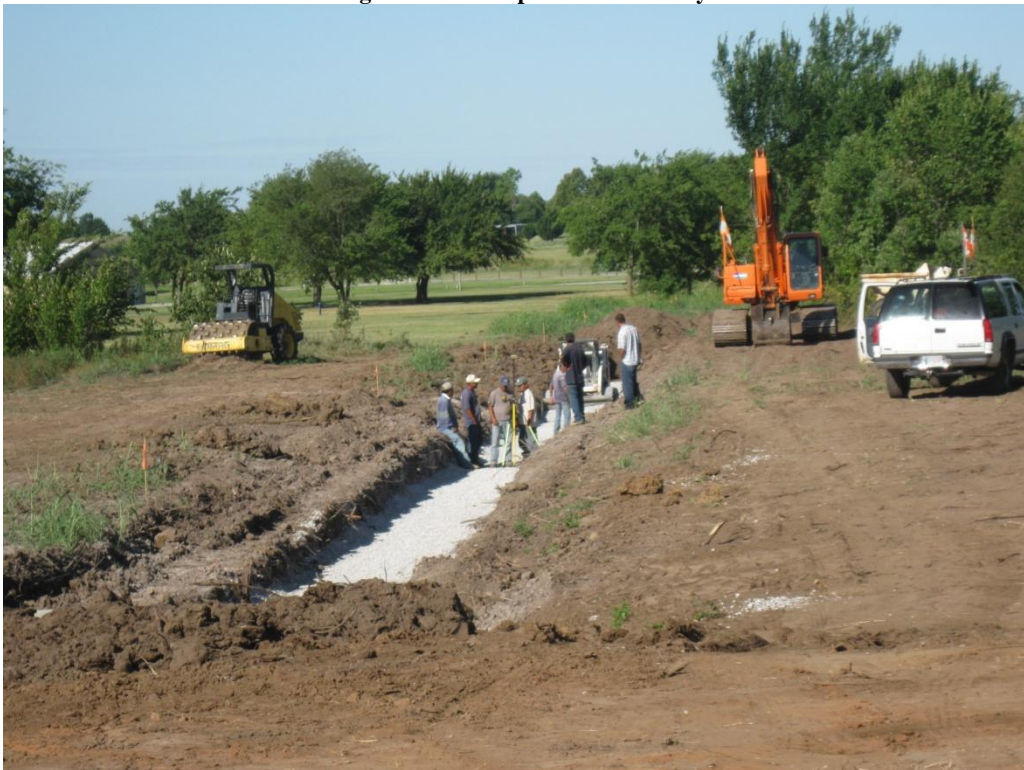
Beginning work on concrete lined ditch channel for Phase 2